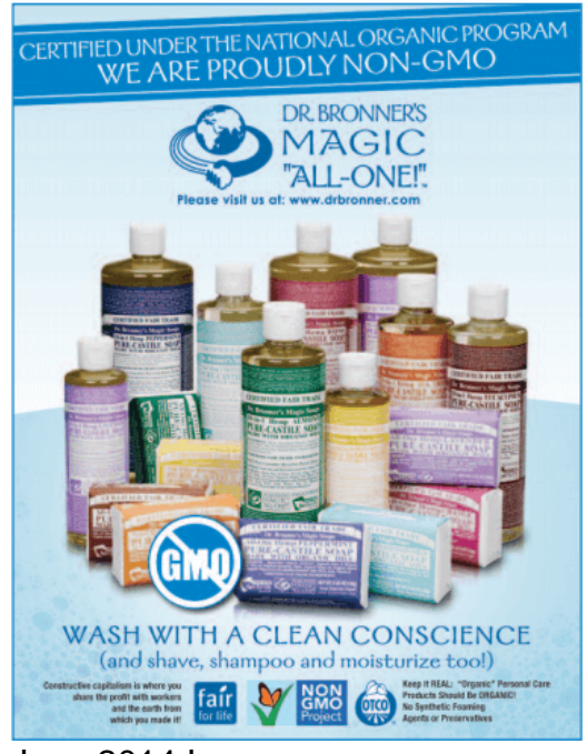
June 2014 Issue