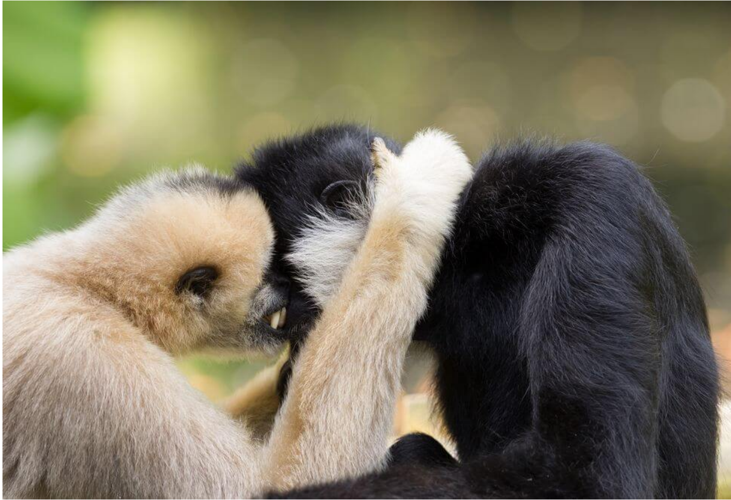
Gibbons mate for life.