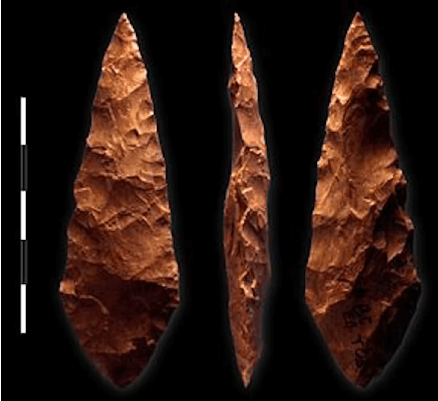
Middle Stone Age technology.

That creates a puzzle. If Pleistocene hunter-gatherers were as smart as us, why did culture remain so primitive for so long? Why did we need hundreds of millennia to invent bows, sewing needles, boats? And what changed? Probably several things.