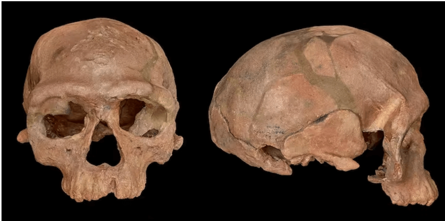
300,000 ya skull, Morocco.

Assuming the brain was as modern as the box that held it, our African ancestors theoretically could have discovered relativity, built space telescopes, written novels and love songs. Their bones say they were just as human as we are.