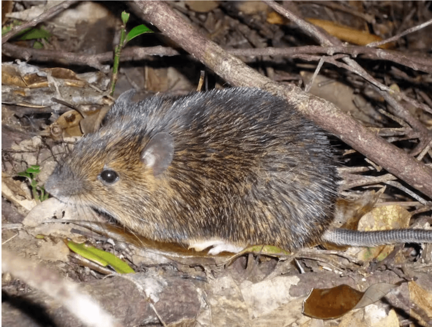
The Amami spiny rat ( Tokudaia osimensis ) is endemic to the Japanese island of Amami Ōshima.

Although it's not yet clear how the mole voles determine sex without the SRY gene , a team led by Hokkaido University biologist Asato Kuroiwa has had more luck with the spiny rat – a group of three species on different Japanese islands, all endangered.